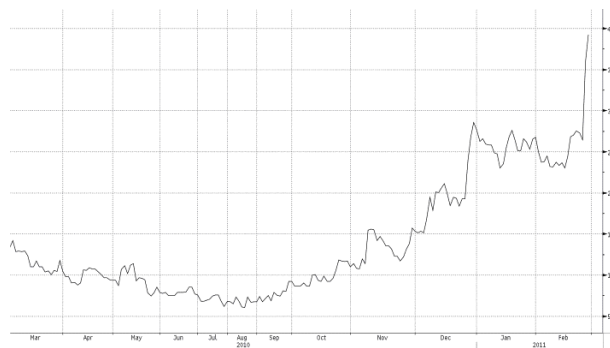
Xtierra Inc. 1 year Share Chart