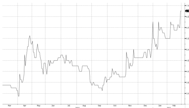
Minco plc 1 year Share Chart

TESLA - IMC International Limited has been contracted to complete about 22 line kilometres of 2D hammer seismic geophysical survey over the Caherconlish area commencing in early March. It is hoped that the survey data will assist with the identification of the southern boundary structure, the Ballyneaty Fault, with which higher grade and greater thicknesses of mineralisation might be associated. Drilling to explore the boundary fault has been postponed until completion of the geophysical survey.