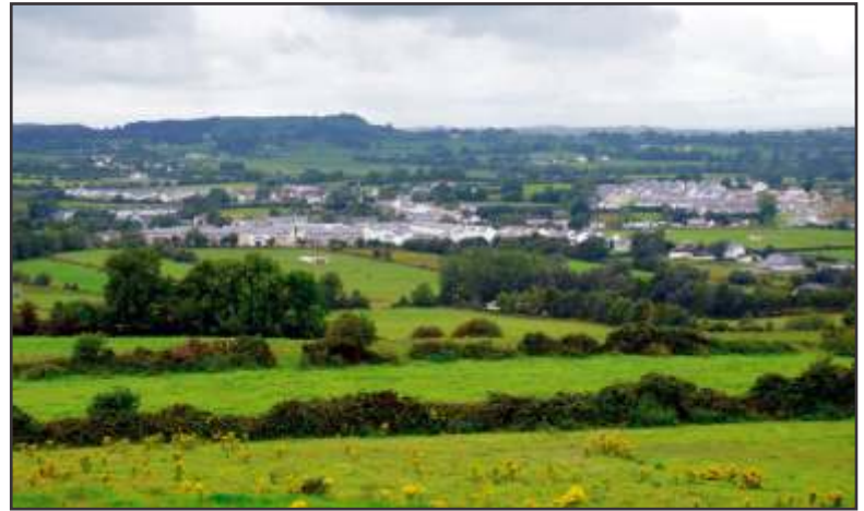
Village of Caherconlish lies to the west of the Tobermalug deposit

A resource estimate of 24.1 million tonnes averaging 9.2% combined zinc plus lead was released by Xstrata in August 2010.